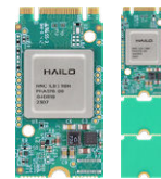
M.2 Key B+M (2242/2260/2280)

Compatible with M.2 form factor, the Hailo-8L™ based modules can be plugged into an existing edge device with an M.2 socket to execute deep neural network inferencing in real-time utilizing low power for a broad range of market segments.